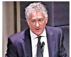
Are You Ready For The New International Rivals?