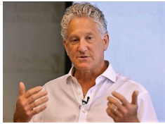
Balancing Growth Opportunities and Risks

See link at bottom of box below for all videos