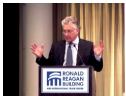
Global Innovation and Entrepreneurship