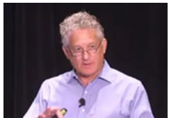
Managing to Enhance Corporate Competitive Agility